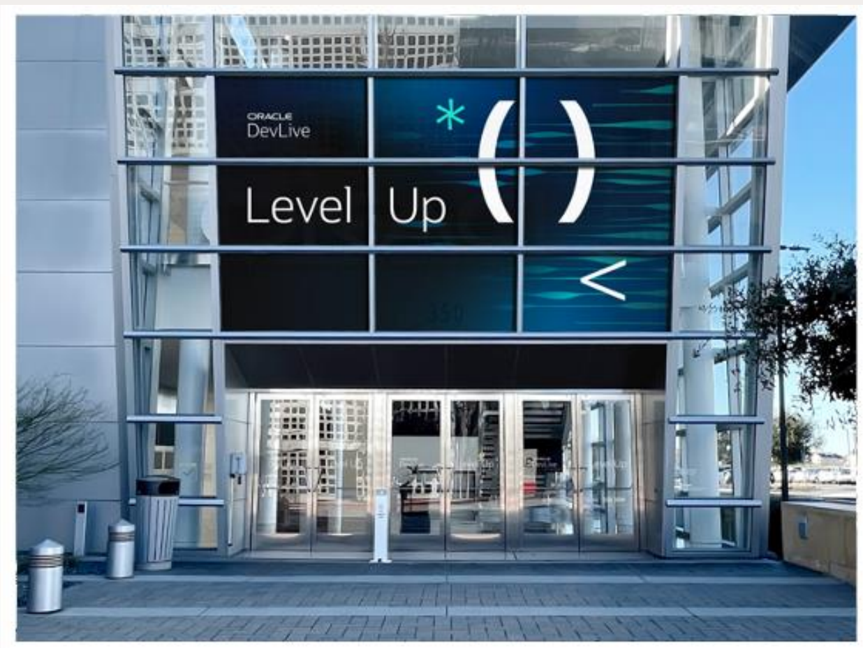
Oracle Conference Center exterior entryway