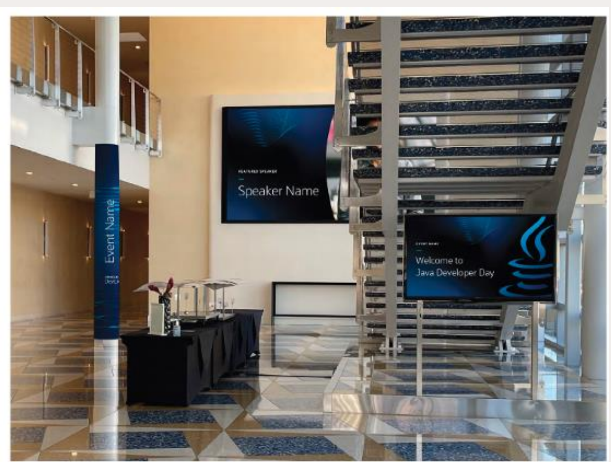
Oracle Conference lobby