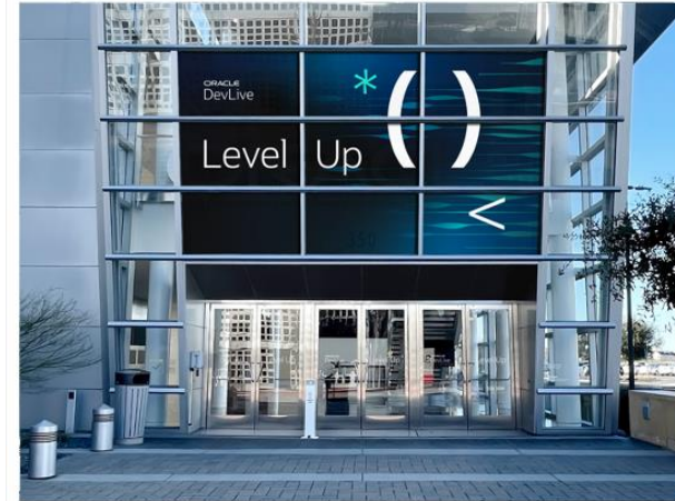
Oracle Conference Center exterior entryway