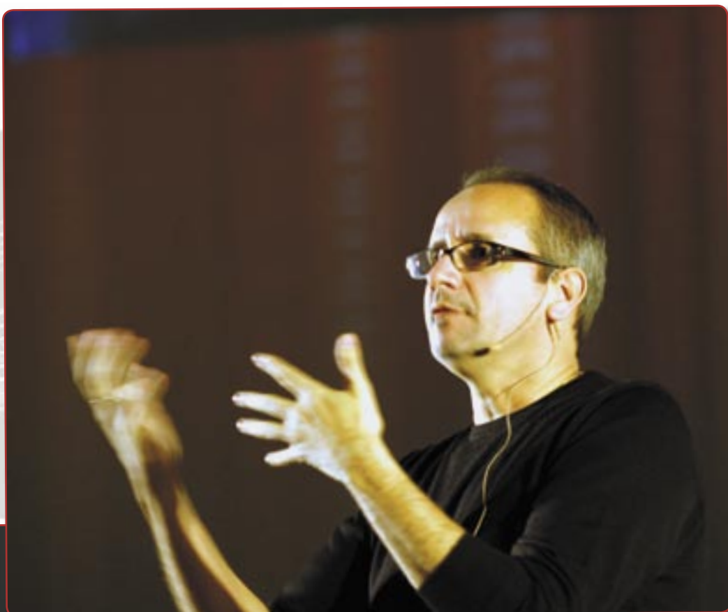
Erich Gamma, IBM Distinguished Engineer: “Tools are at the core! Not processes. There are many different practices, rules and processes that can get in your way. Therefore Jazz is process neutral.”